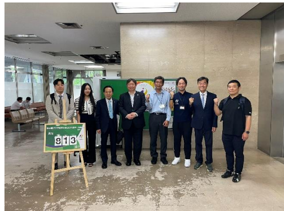
e) 5th Meeting – Final confirmation of the adjustments to Taekwondo medal events